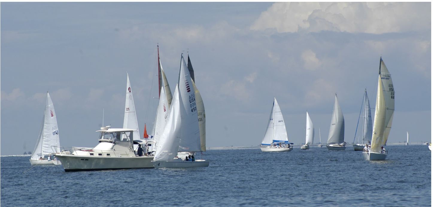
Sunmerset Race Start