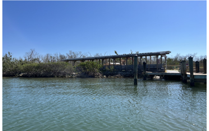
What's left of the State Park docks