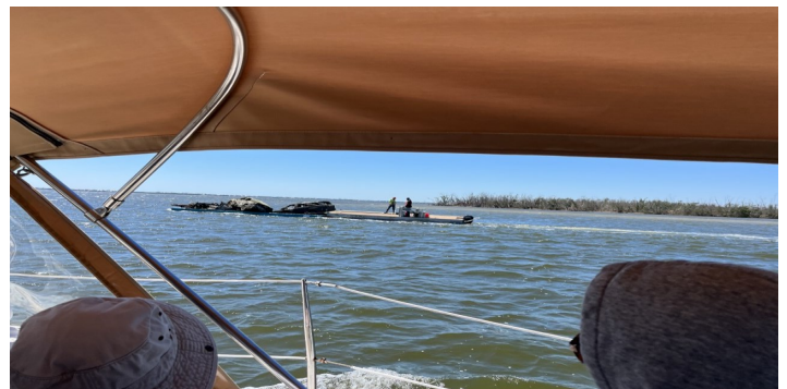
Salvaging hurricane damaged vehicles in the Caloosahatchee (photo by Carol Pim March, 2023)