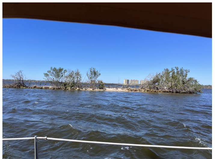
What little remains of Little Shell Island in the Slow zone of the Caloosahatchee