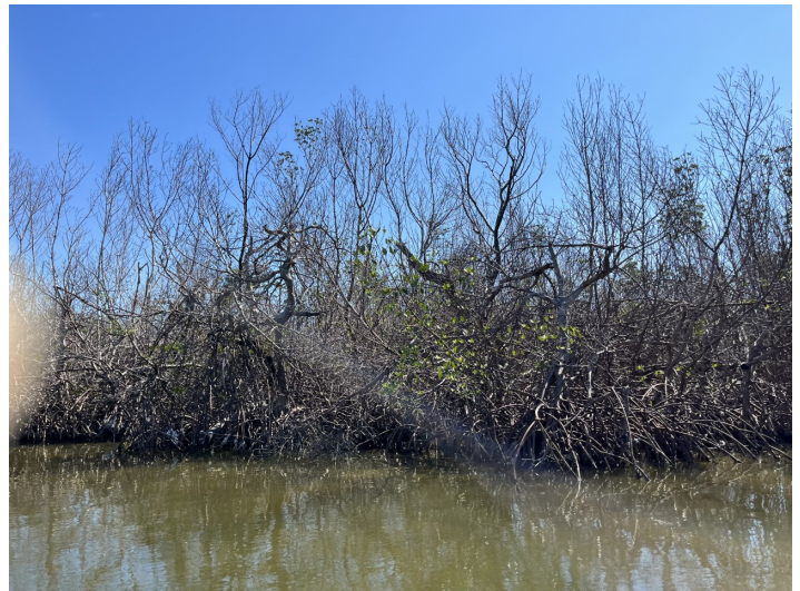
Typical destruction on Cayo Costa