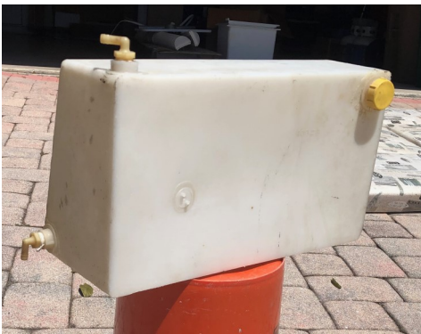
PVC water tank 12"x20"x7.5 '1/5.5"