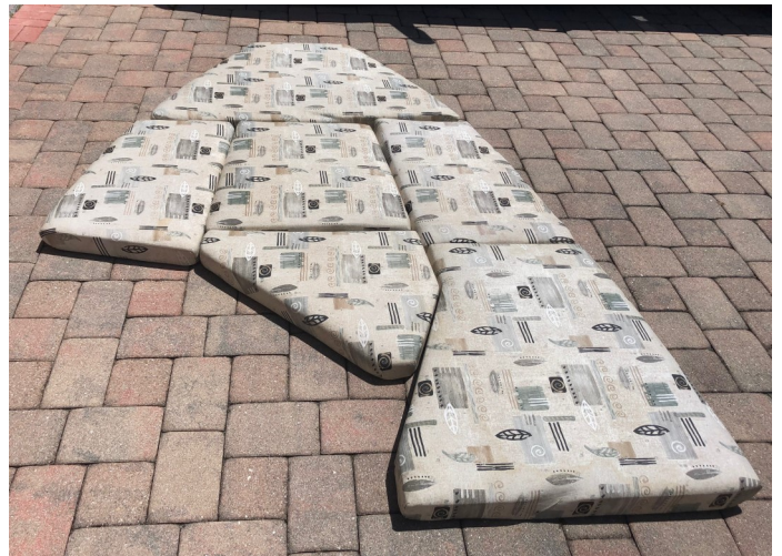
Cabin cushions for 25' walkaround. Never kept on boat. Rarely used. Excellent condition. Best Offer