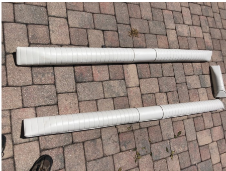
New cockpit bolsters—approx. 7' long x 5" wide with hardware. $50 OBO

Chowder Chatter Editor, P.O Box 101268, Cape Coral, FL 33910