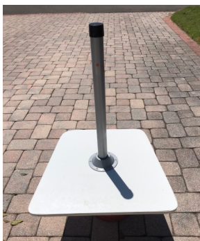
Pedestal table. 26"x27"/21" Surfit pole 27"x2". Base not included. $20.

All items have been stored in my garage attic. No damage. Very good condition. Boat was an Ian loss. No items were on the boat. For more information contact: Steve Roake. steve@theroakes.com 630/816-1496.