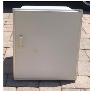
Built- in ice box. New-never used. Approx. 17'x20'x15". Flush mount. $25 OBO