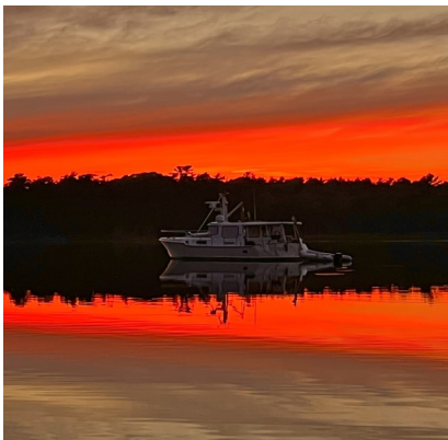
Smoke and haze from Canadian wildfires create stunning sunsets.

I know this is falling on deaf ears but this has been an unusually cool summer with clouds and rain showers.