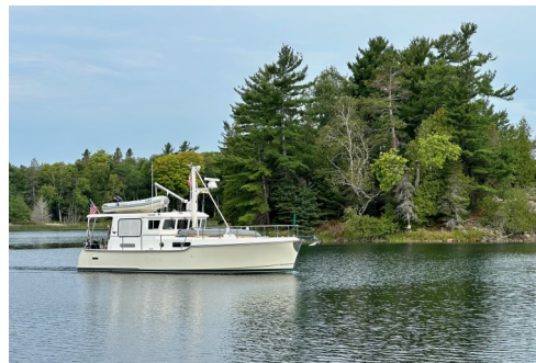
Ranger departing Hotham Island anchorage after a week of relaxation at anchor.